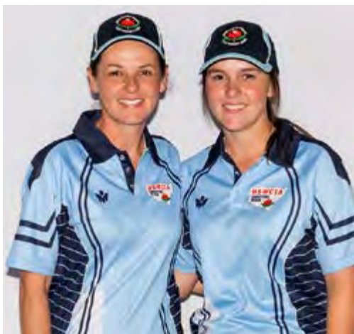
New South Wales Women's Team