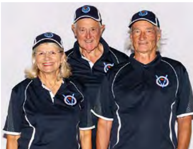
Victorian Veteran Team