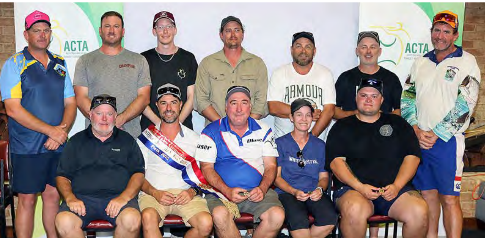
Open Postal Team