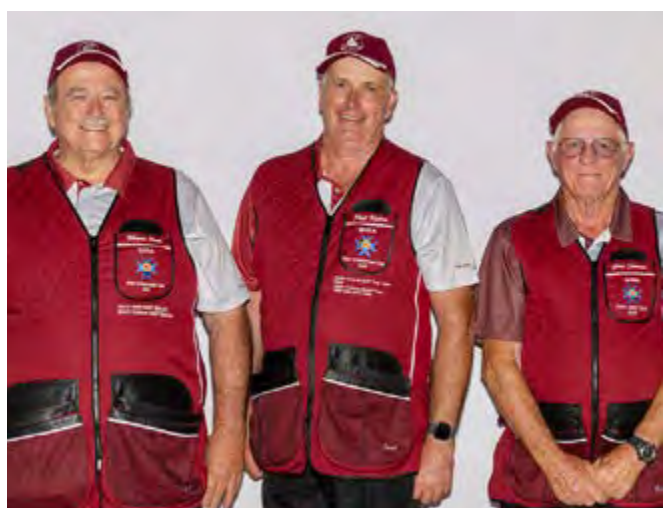
Queensland Veteran Team