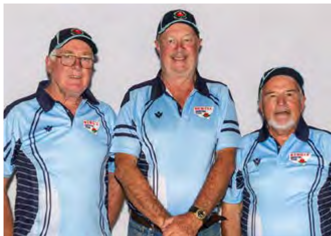
New South Wales Veteran Team