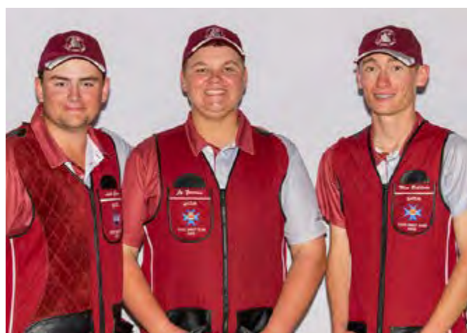
Queensland Junior Team