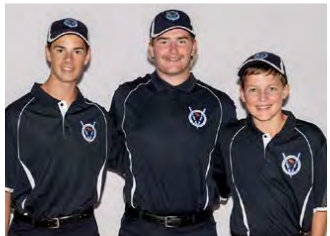
Victorian Junior Team