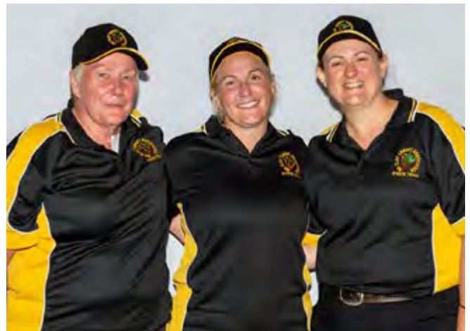
Western Australia Women's Team