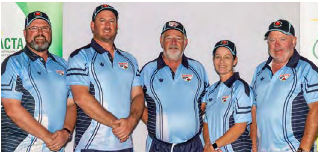
New South Wales Open Team