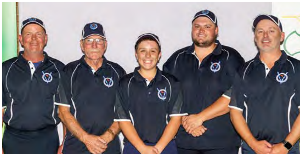
Victorian Open Team