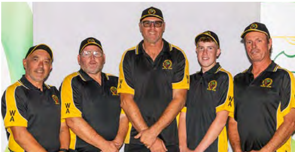
Western Australia Open Team