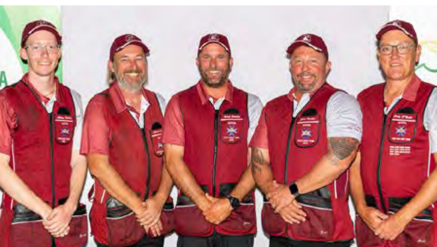
Queensland Open Team