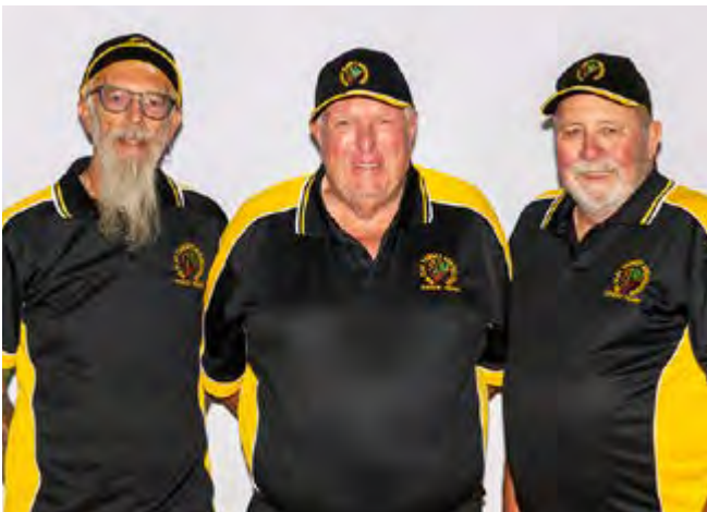
Western Australia Veteran Team