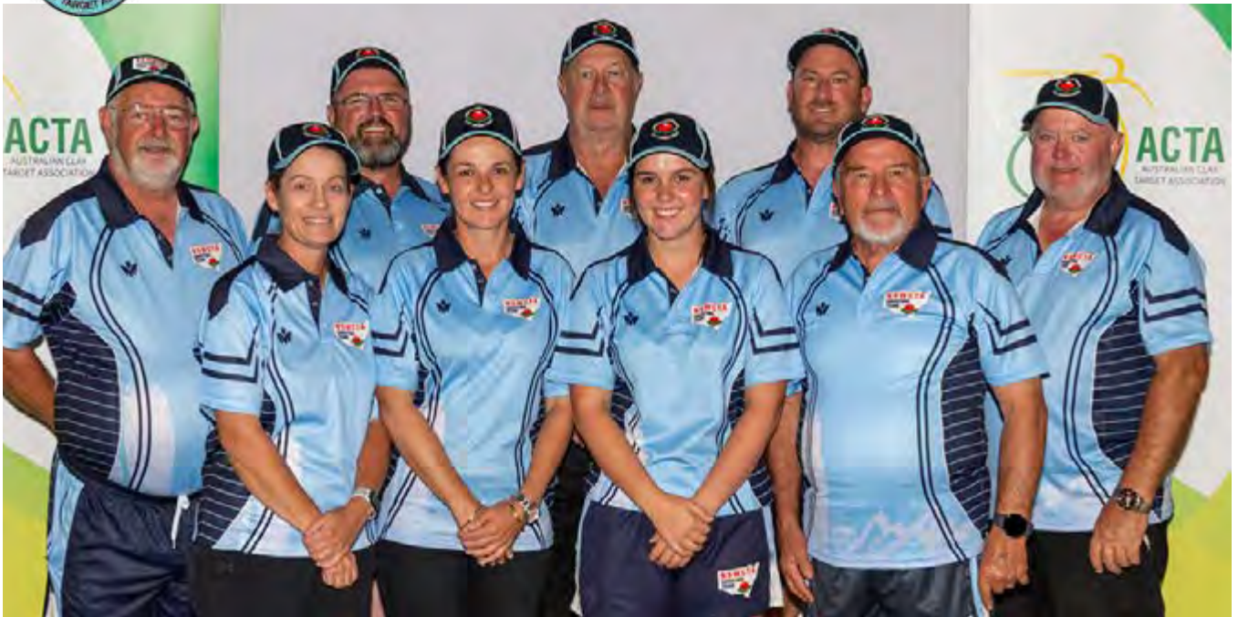
New South Wales Combined Team