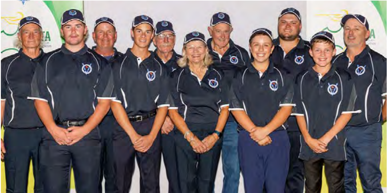
Victorian Combined Team