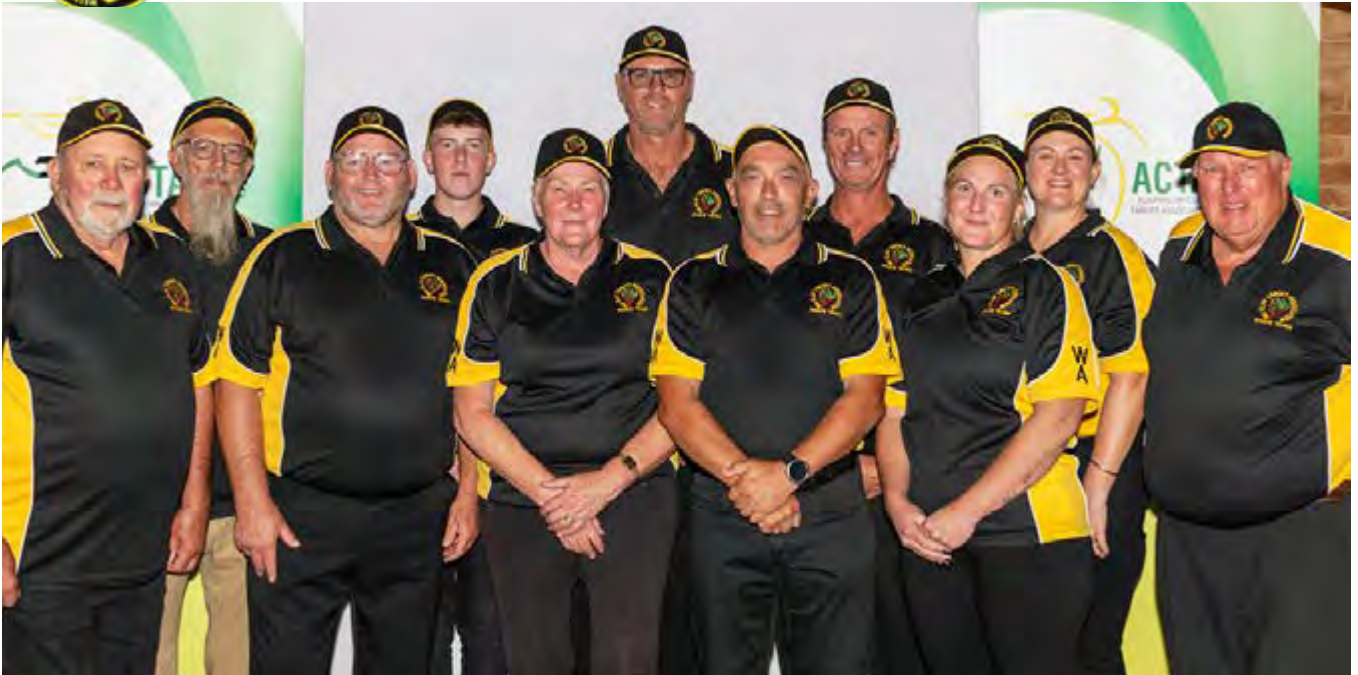
Western Australia Combined Team