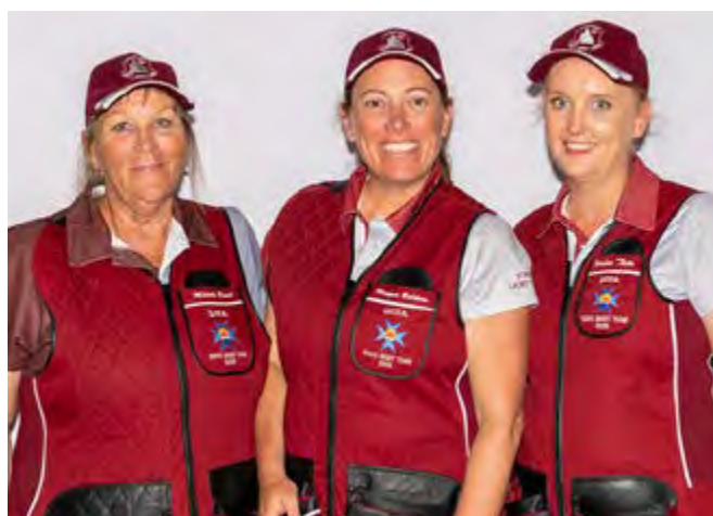
Queensland Women's Team