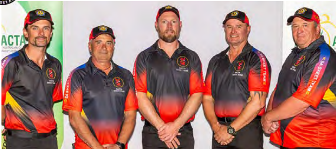
South Australian Open Team