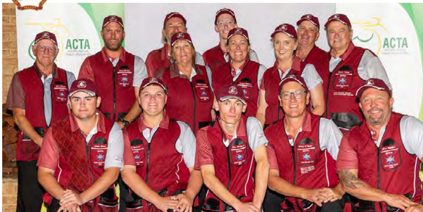
Queensland Combined Team