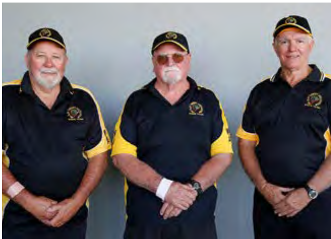
Western Australia Veteran Team