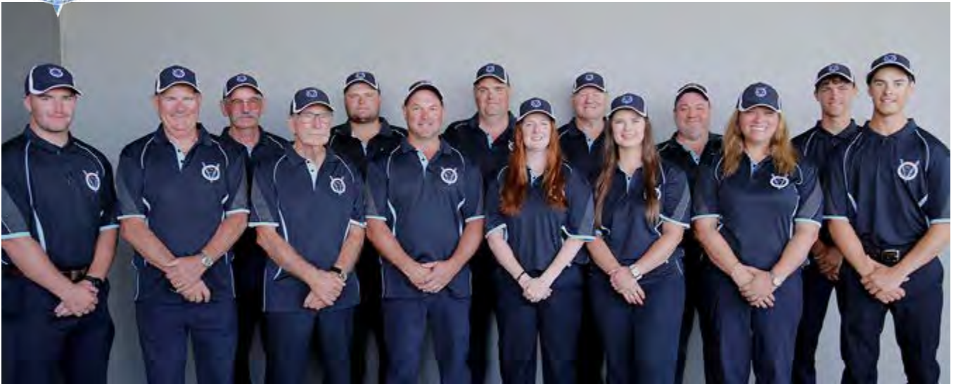
Victorian Combined Team