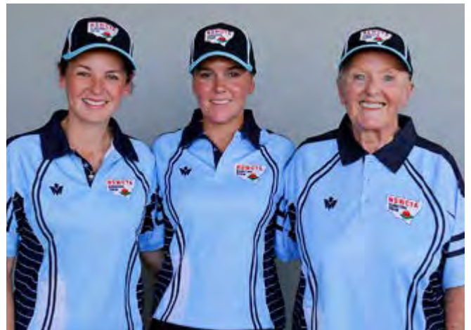
New South Wales Women's Team