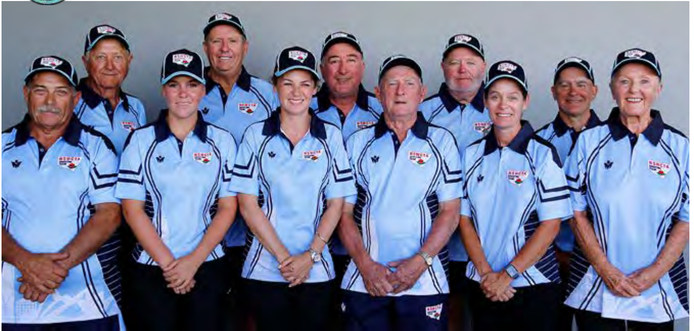
New South Wales Combined Team