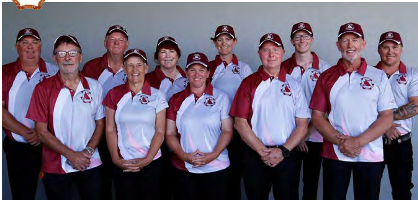
Queensland Combined Team