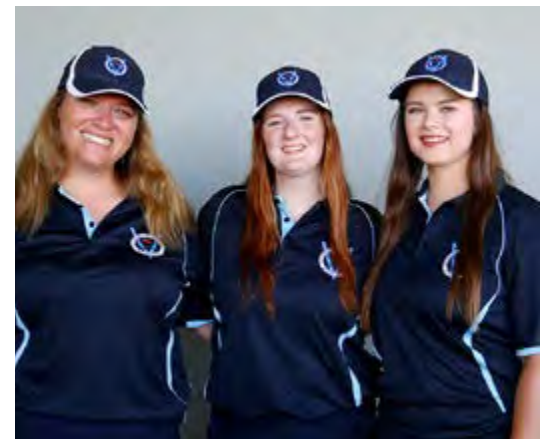
Victorian Ladies Team