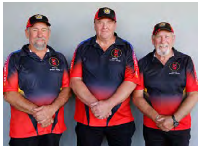
South Australian Veteran Team