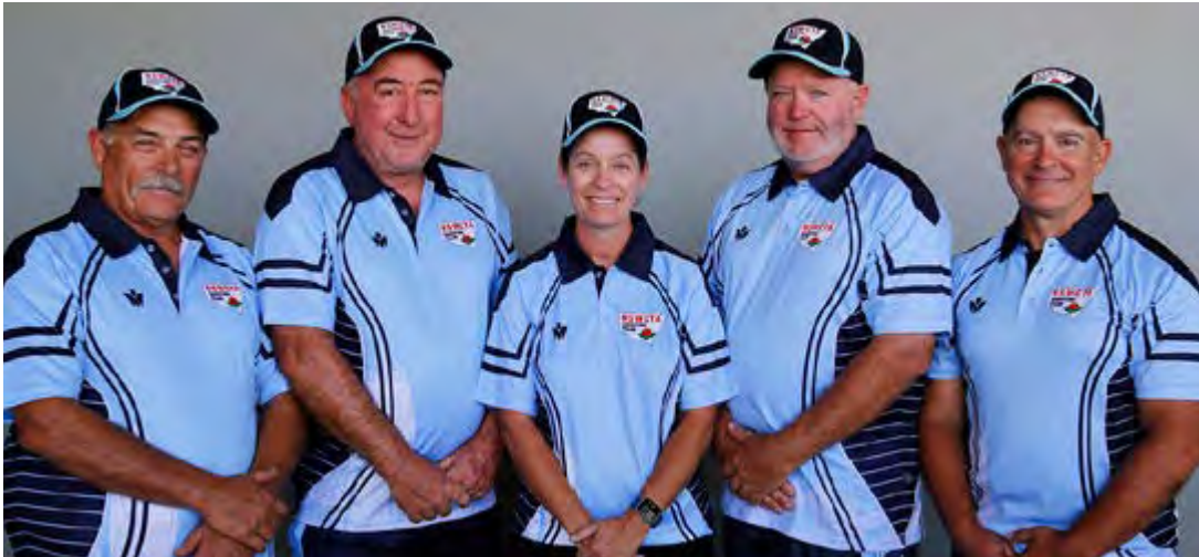
New South Wales Open Team