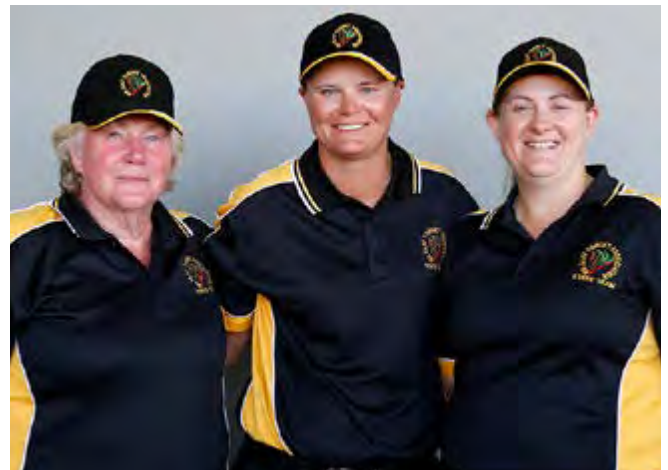
Western Australia Women's Team