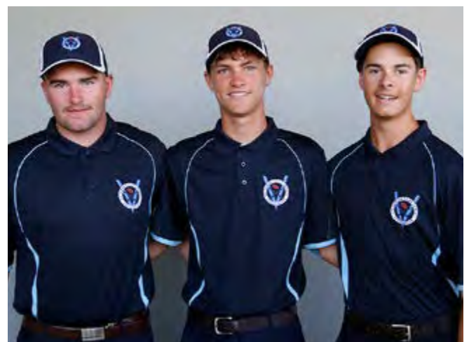
Victorian Junior Team