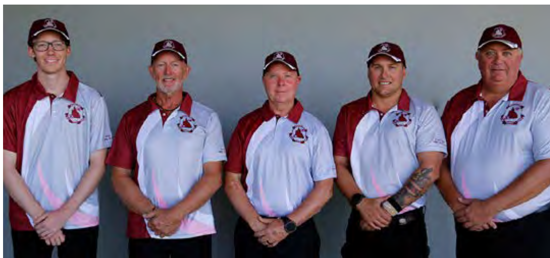
Queensland Open Team