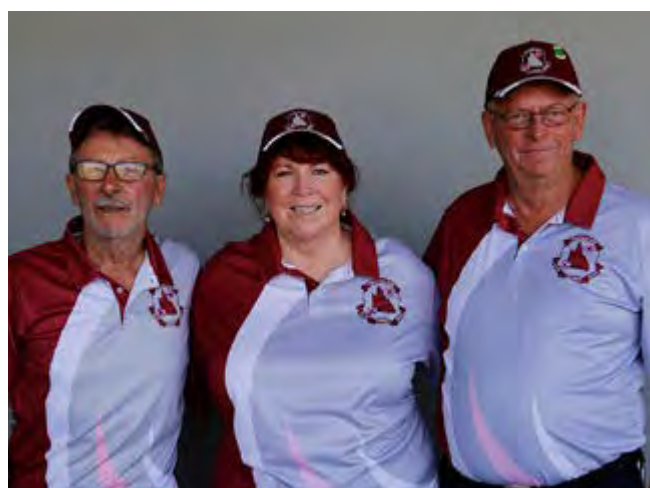
Queensland Veteran Team