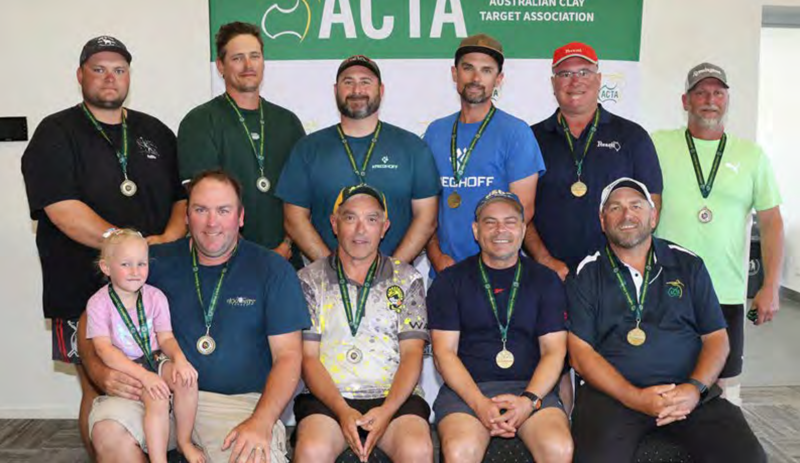
All Australian Team