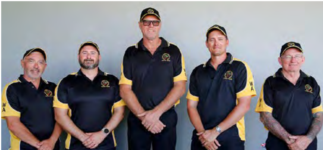
Western Australia Open Team