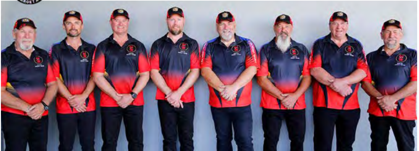
South Australian Open Team