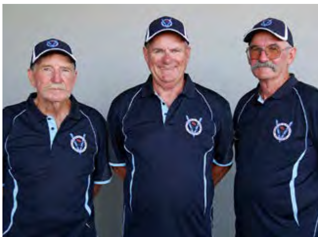
Victorian Veteran Team