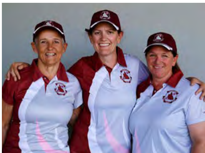
Queensland Women's Team