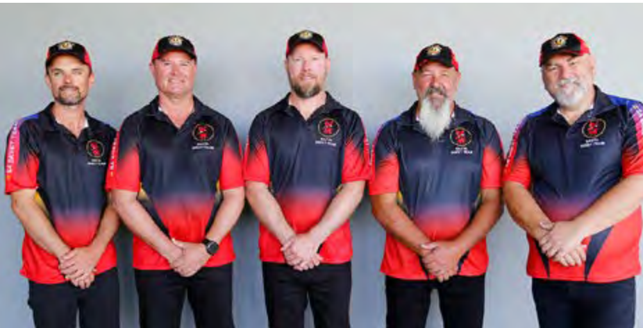
South Australian Open Team