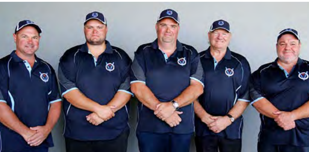
Victorian Open Team