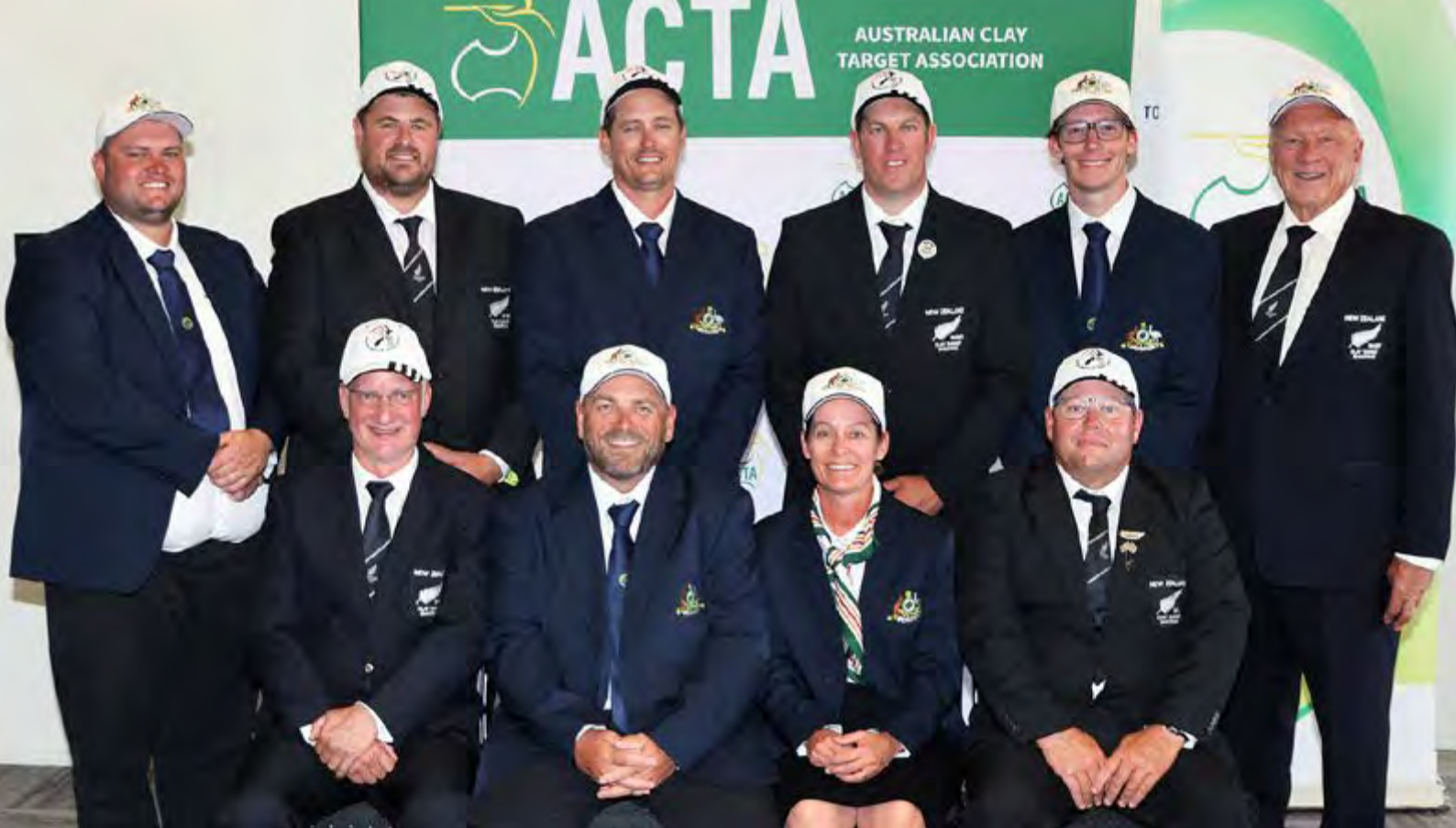
Glenn Trophy: Australia vs New Zealand