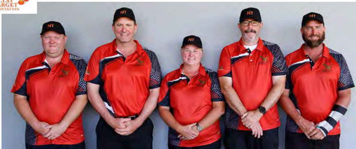
Northern Territory Open Team