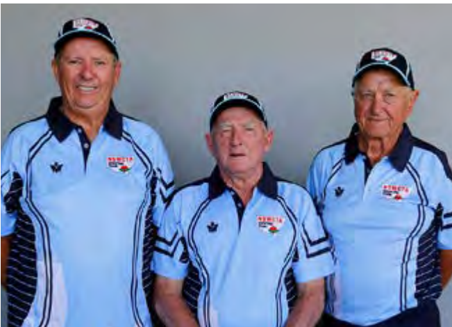
New South Wales Veteran Team