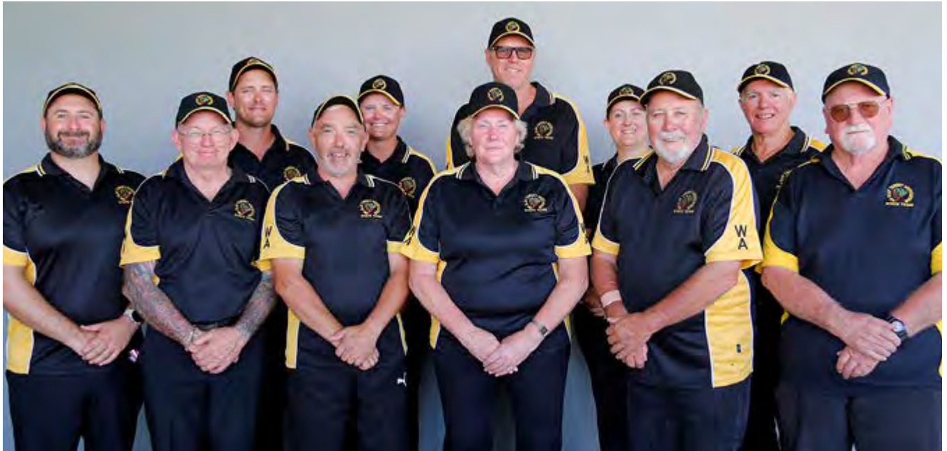
Western Australia Combined Team